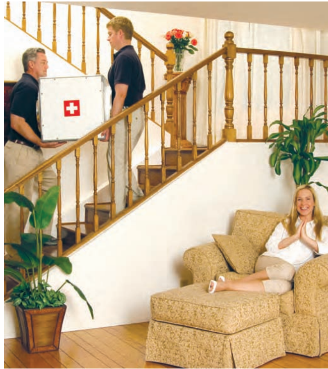
Simple, Clean Installation by IQAir® Authorized Professionals.

With the Perfect 16, you can transform your house in to a healthy home!